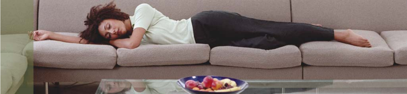
Princes Street, St Clements, Oxford OXRPPS2

This most spacious two bedroom town house is located in an ideal position near to St Clements and Magdalen Bridge. It is within easy walking distance of the city centre as well as being close to excellent amenities, shops, bars and restaurants.