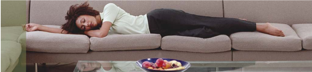
Rewley Road, City Centre, Oxford OXTTRR

A well presented two bedroom apartment centrally located with excellent access to Said Business School, central University buildings and the main bus and train station. The accommodation comprises one double and one twin bedroom, a modern well equipped kitchen, sitting/dining room with flat screen TV/DVD incl. Freeview and a bathroom with corner bath.